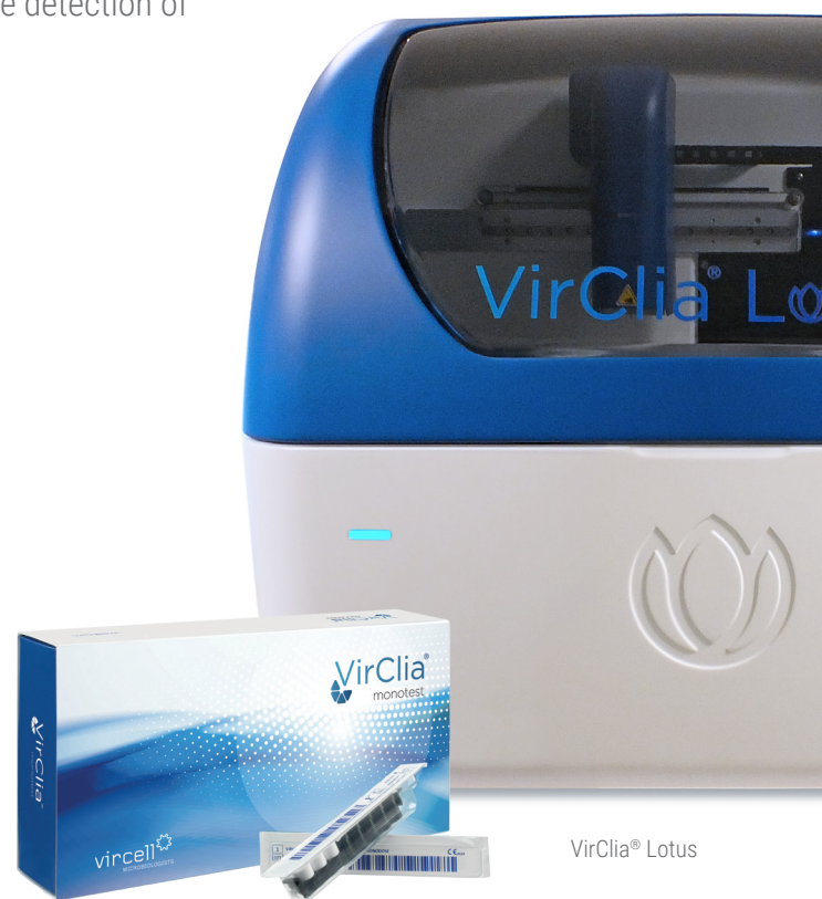
VirClia® MONOTEST - 24 tests